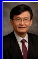
Lip-Bu Tan President & CEO, Cadence Design Systems